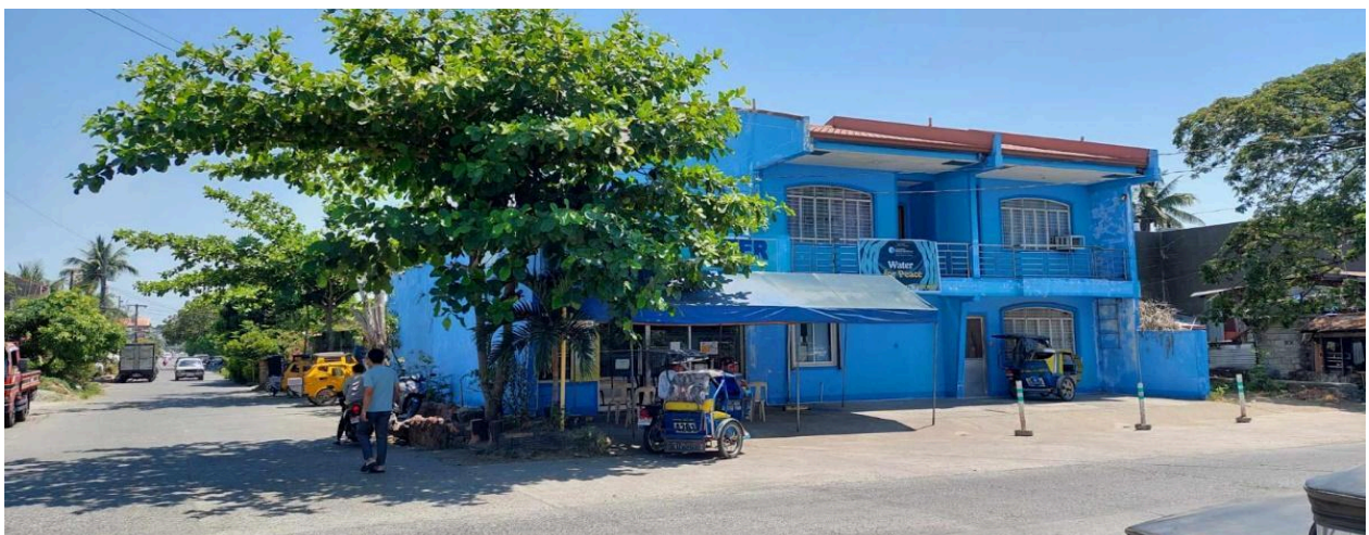
Solano Waters Office of Solano, Nueva Vizcaya