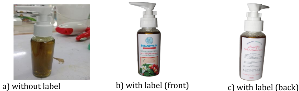
Formulated Liquid Hand Soap

Figure 4 has a yellow-brown color with no odor. It has a transparent and thin consistency. As presented in Table 5, the pH level is within the standard pH level for liquid hand soap which is around 4-10. Moreover, the foam stability falls within the accepted range of 60-70%. Lastly, the liquid soap is homogenous because coarse particles are absent and the consistency is smooth and fine.